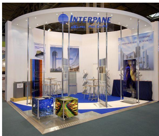
Space only Example

Shell scheme option your stand will be built for you already by our shell scheme supplier. The shell scheme is constructed from 2.4m white panels. A name board is erected on the perimeter of the open sides. Your company name is printed on this. Shell Scheme option includes 2 spot lights and a 500w electrical socket. Standard shell scheme stands are 6m 2 3m x 2m.