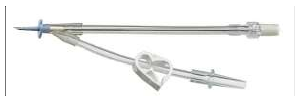
Figure 2. DLP cannula

Once the DLP cannula is in place and open to air, the cardiothoracic surgeon announces that the aortic arch is vented, at which point the NRP pump may begin. The time will be recorded on the National DCD Heart Passport. If there is copious arterial bleeding from the DLP cannula, the NRP pump must stop and the clamp on the descending aorta must be repositioned to occlude the aorta. Only then can the NRP pump re-start.